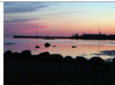
The Baltic Sea